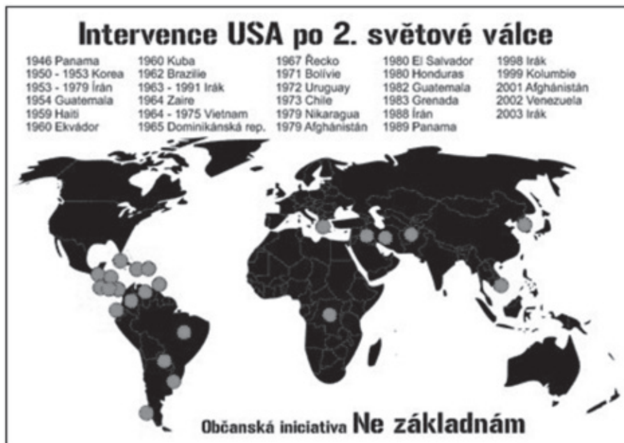
Picture 1: Interventions by the U.S. after World War II.

There is an infographic at the bottom of the list which places each intervention on the global map (see Picture 1).