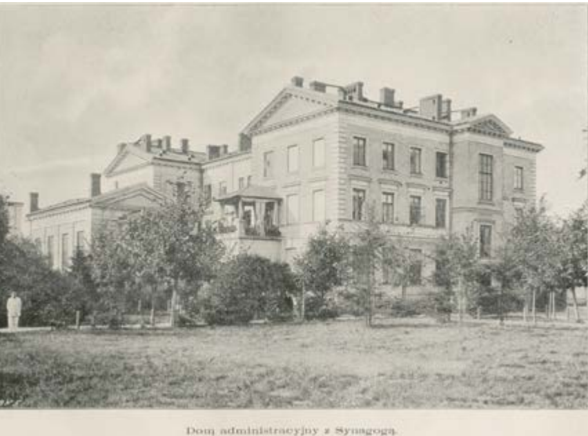
Figure 2. Administrative building with a synagogue