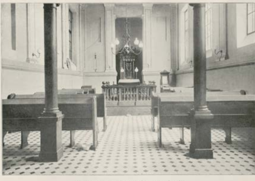
Figure 4. The interior of the synagogue