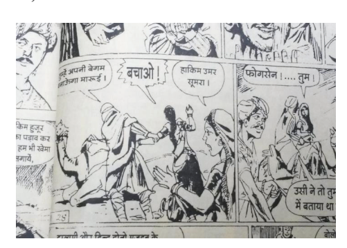
The comic story featuring the episode of Mārūī's abduction ( Surabhi 2003: 79).

Then, in the story from the magazine Surabhi , there follows an episode which is absent from the published versions of the \bar{U}mar-M\bar{a}r\bar{u}\bar{\iota} story, created in order to make the action of the comic more dynamic. In the kingdom of \bar{U} mar, injustice and disorder set in because of the shameful act of the woman's abduction by the king. \bar{U} mar leaves his fortress and wanders in disguise in the streets of Umarkot in order to learn what his subjects think of this act and he is subsequently attacked by a group of bandits and rescued by Khetsen, M\bar{a}r\bar{u}\bar{\iota} 's fiancé, who had come to Umarkot. When the king wants to reward him for saving his life, Khetsen asks him to send M\bar{a}r\bar{u}\bar{\iota} back to her homeland. \bar{U} mar does