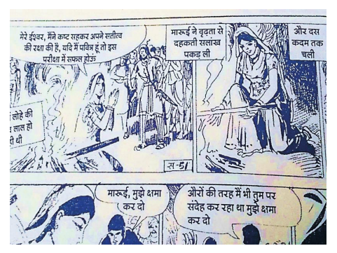
Mārūī holds hot iron ( Surabhi 2003: 84).

In the comic version of the story, Mārūī returns to Malīr with splendid presents from Ūmar for all the inhabitants of the village. This also causes doubts about her virtue due to the fact that she has stayed so long in the house of a strange man. She has to prove her innocence by