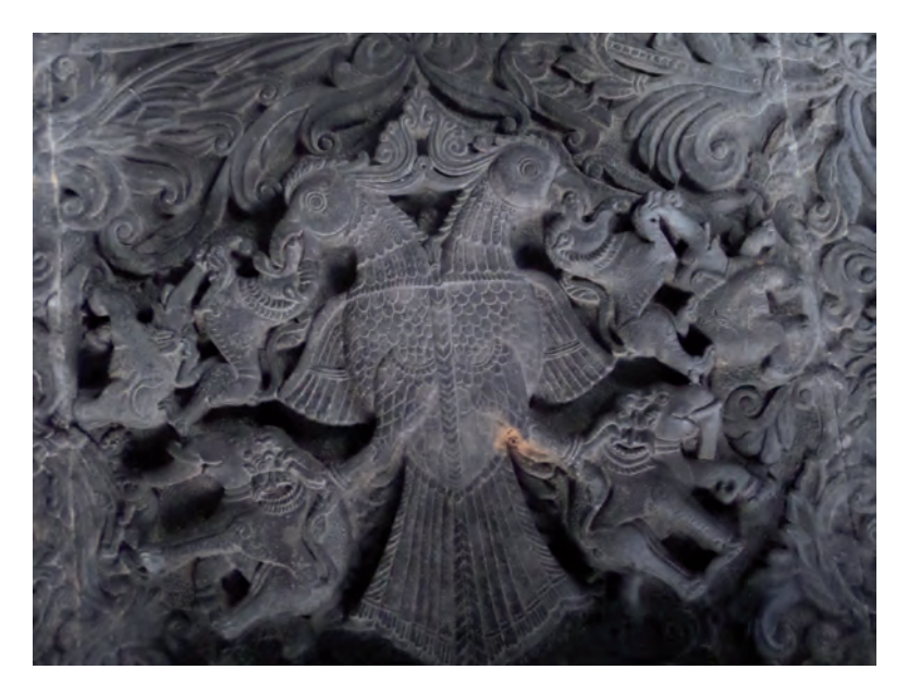
Fig. 2. Gandabherunda on the ceiling of the mandapa