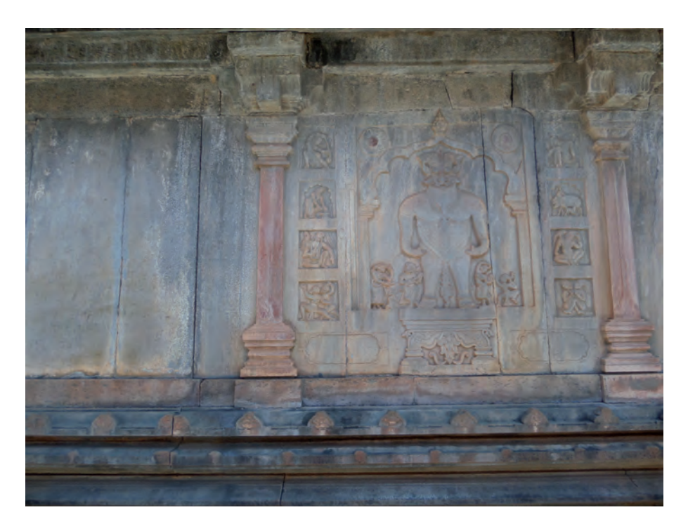
Fig. 8. A supposed Śarabha-Vīrabhadra/vāstupuruṣa on the western exterior wall of the hall enclosing garbhagṛha