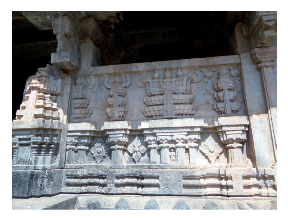
Fig. 4. A two-headed bird on the external walls