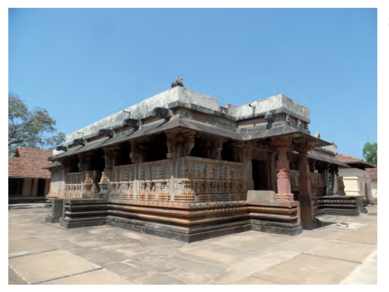
Fig. 1. Keladi, the Rāmeśvara temple complex with the Vīrabhadra temple in the foreground