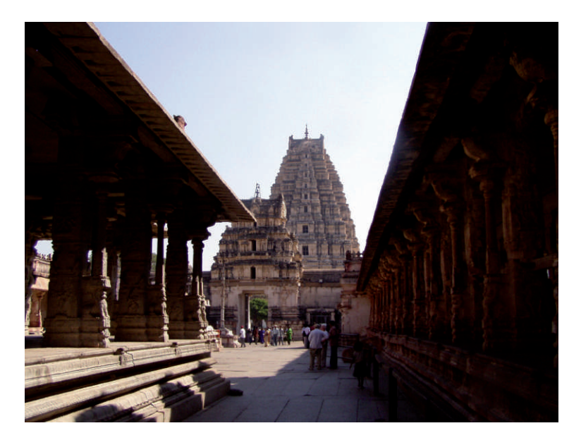
Fig. 1. Virūpākṣa Temple in Hampi.