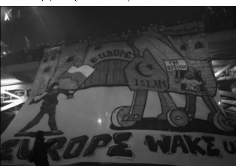
The banner displayed during the March of Independence in November 2017 in Warsaw

right. The second group is the hero's community which stands between the corruption on one end and savagery on the other. These are the 'real Poles'. The third group is the uncivilized enemy of the civilized folk. This group belongs to the foreign world that will not accept 'our' values. According to the banners carried at the March of Independence, the corrupt EU elites would make a pact with the immigrants, a deal which would hurt the Poles (the heroes of the mythical narrative). Greek myth was used as the building material for writing the proto-national epics The Iliad and The Odyssey. In the Polish discourse displayed on Independence Day is a straightforward reference to the wooden horse from The Iliad - one of the banners read: 'Muslim refugees - the Trojan horse of terrorism for Europe'. On the website "Polonia Christiana24pl" which defines itself as the 'right side of the Internet', we can read an article by Tomasz Korczyński, "The Trojan horse and the blind of Europe". Korczyński diagnoses the conquest of Europe directed by ISIS, blaming the Germans as the contemporary Trojans worshiping the idol of political correctness. 46 In 2017, this allusion was also made by Prime Minister of Hungary Viktor Orban, saying that migrants, many of whom are Muslims, are a threat to Europe's Christian identity and culture: The people that come to us don't want to live according to our culture and customs but according to their own – at European standards of living.<sup>47</sup>