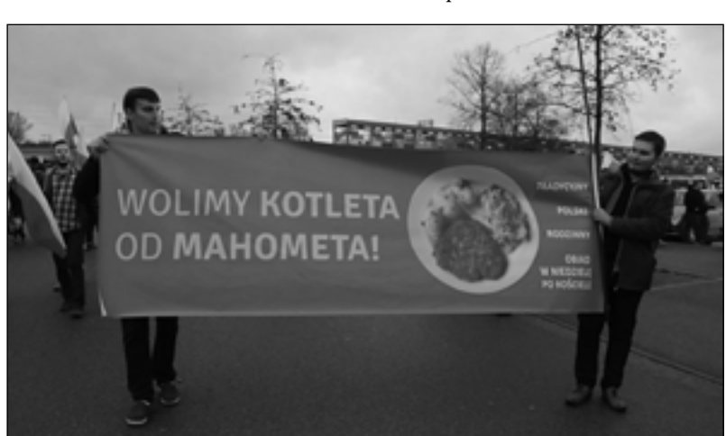
A banner carried at the March of Independence in 2015

In 2015, some of the protesters in the March of Independence marched shouting the slogan 'Poland for the Polish'. There was also a strong anti-Islamic and anti-refugee streak to these commemorations. The participants carried banners depicting images of the Prophet Mohammad with the words 'not welcome'. Other banners read: 'Terrorism, Islam, Sharia Law? No, thanks', 'Stop Islamisation', and 'Poland free of Islam'. Some of the phrases emphasized the importance of religion: 'To be a Pole, to be Catholic is a privilege and honor', while some of them openly defended Polish customs, threatened by Islamic regulation: 'We prefer pork cutlets to Mohammad. Traditional Polish dinner after the Sunday church service', and glorifying Polish culinary traditions. Many carried the national white-and-red flag while others held banners depicting a falanga , a far-right symbol dating to the 1930s.