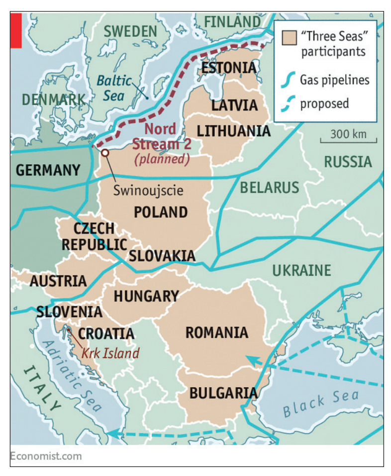
Figure 3. The Three Seas Initiative and the Energy Dependence