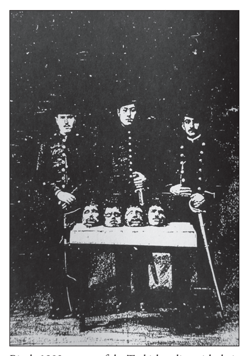
Bitola 1902, agents of the Turkish police with their trophies, Македонско движење , 5 August 1902

The Greeks also remained foreign from a cultural and religious viewpoint, with their entire church hierarchy holding religious sway in the region. This provoked a reaction from the elite of the period, who justified their Slavic and Slavic Orthodox roots in opposition to the Greek Phanariots.7 The establishment of the Bulgarian Exarchate, which replaced them in controlling the Orthodox Church in Macedonia, led to an additional perception of the Bulgarian church hierarchy as an enemy of Macedonian identity. This is shown by the actions of the young Macedonian elite and a letter sent to the Sultan in 1890, signed by 120 residents of Ochrid, in which demands were made for the creation of an Orthodox Church independent of the Bulgarians.8 During the later period, the states which after the Balkan wars divided the territory of Macedonia between themselves, thereby abusing Macedonian trust, be-