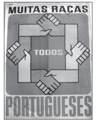
Illustration 1. Muitas raças, Todos portugueses ("Many races, all Portuguese") – one of the propaganda posters collected between 1969 and 1971, preserved and digitalized by Fernando Hipólito, a Portuguese veteran of the war in Angola.<sup>48</sup>

Portuguesas ) during the ongoing national liberation wars in Luso-Africa, two examples of these are provided below. The first one (Illustration 1), entitled Muitas raças, Todos portugueses ("Many races, all Portuguese") fits in with the image of the Portuguese colonialism devoid of racism. While the second (Illustration 2) Povo português é povo africano ("Portuguese people are African people") reflects the unity of the Portuguese and Africans. The figures on the poster embracing each other can symbolize the friendship between them and the "natural" presence of the Portuguese on the African continent.