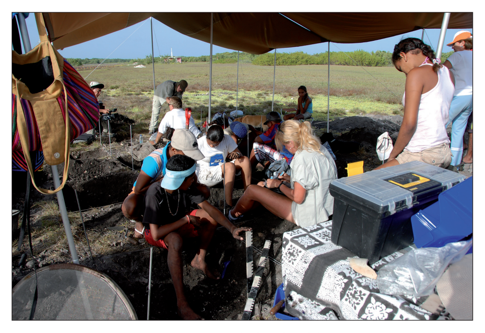
Figure 5. Gran Roque Archeological Workshop 2009