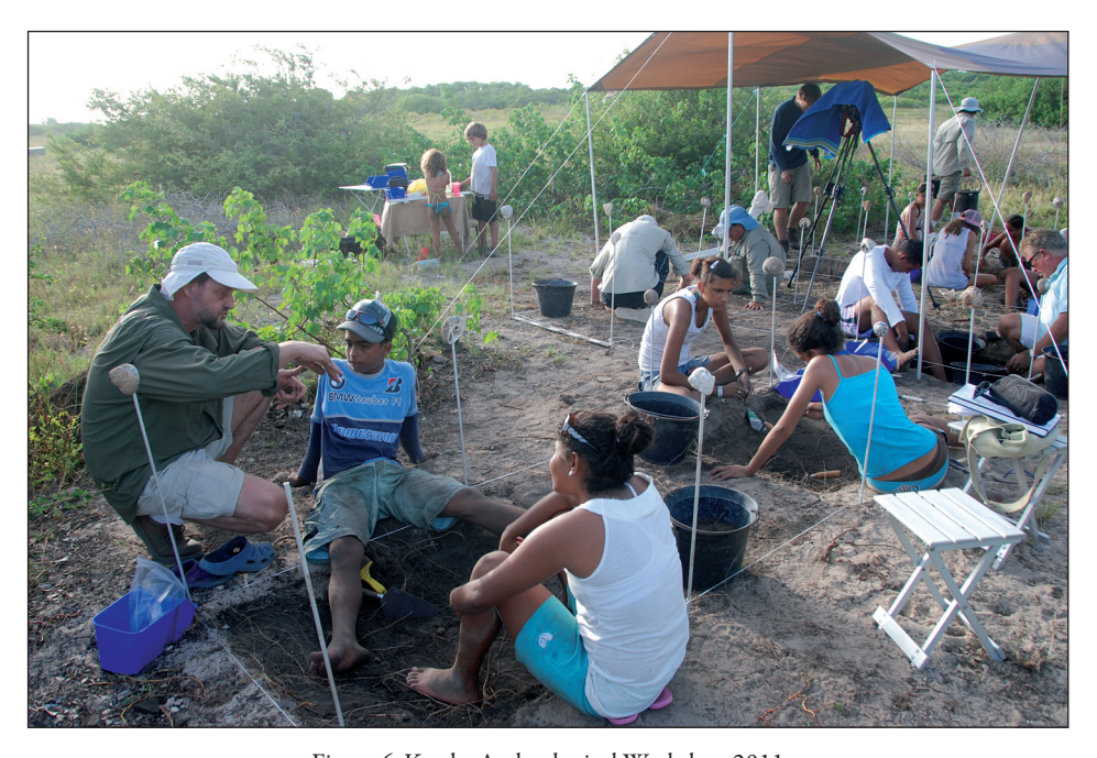
Figure 6. Krasky Archeological Workshop 2011