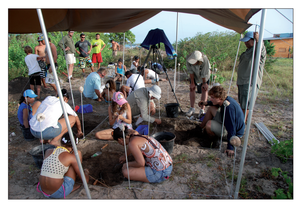
Figure 7. Krasky Archeological Workshop 2011