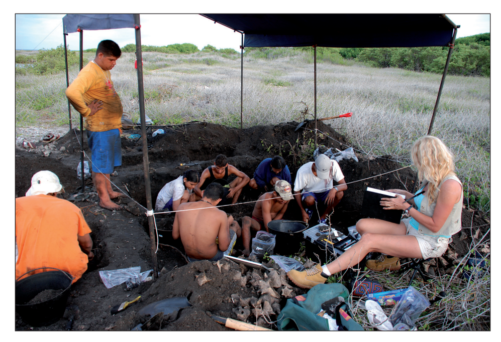
Figure 3. Boca de Sebastopol Archeological Workshop 2007