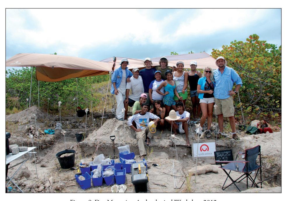
Figure 8. Dos Mosquises Archeological Workshop 2012