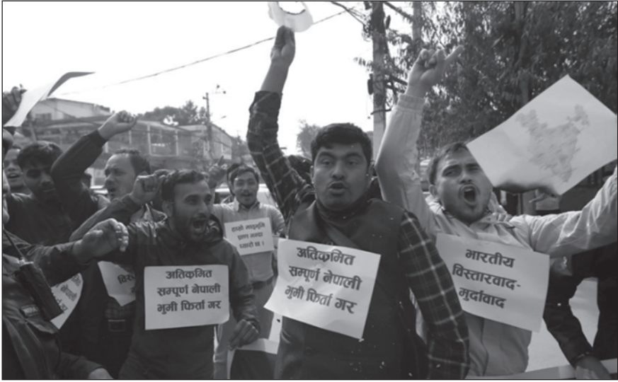
Nepalese citizens protesting the Government of India in Kathmandu.