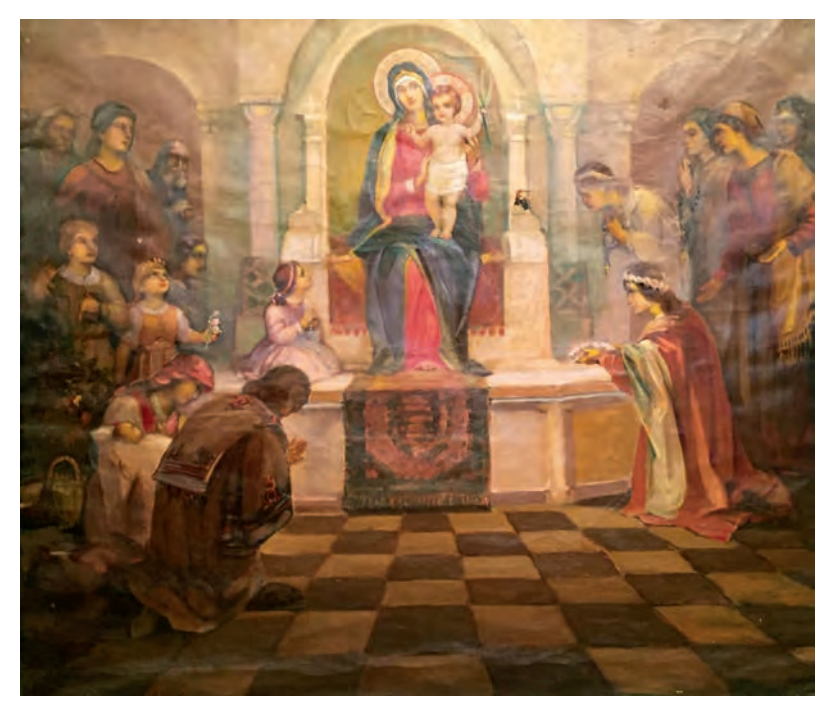
Image 40. Anthony Kubek, [Veneration of an Icon of the Panachranta], Private Collection