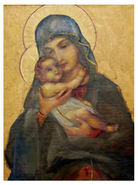
Image 27. Anthony Kubek, [Virgin of Tenderness], Private Collection