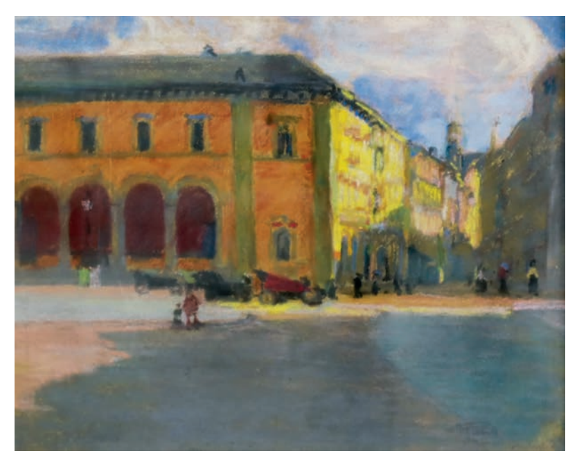
Image 7. Anthony Kubek, [Max-Joseph Platz, Munich, Germany], Private Collection