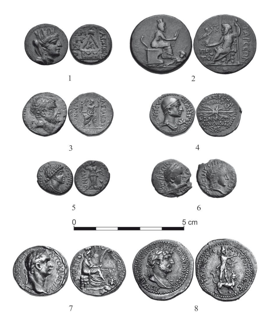
PLATE 3 E. Dąbrowa