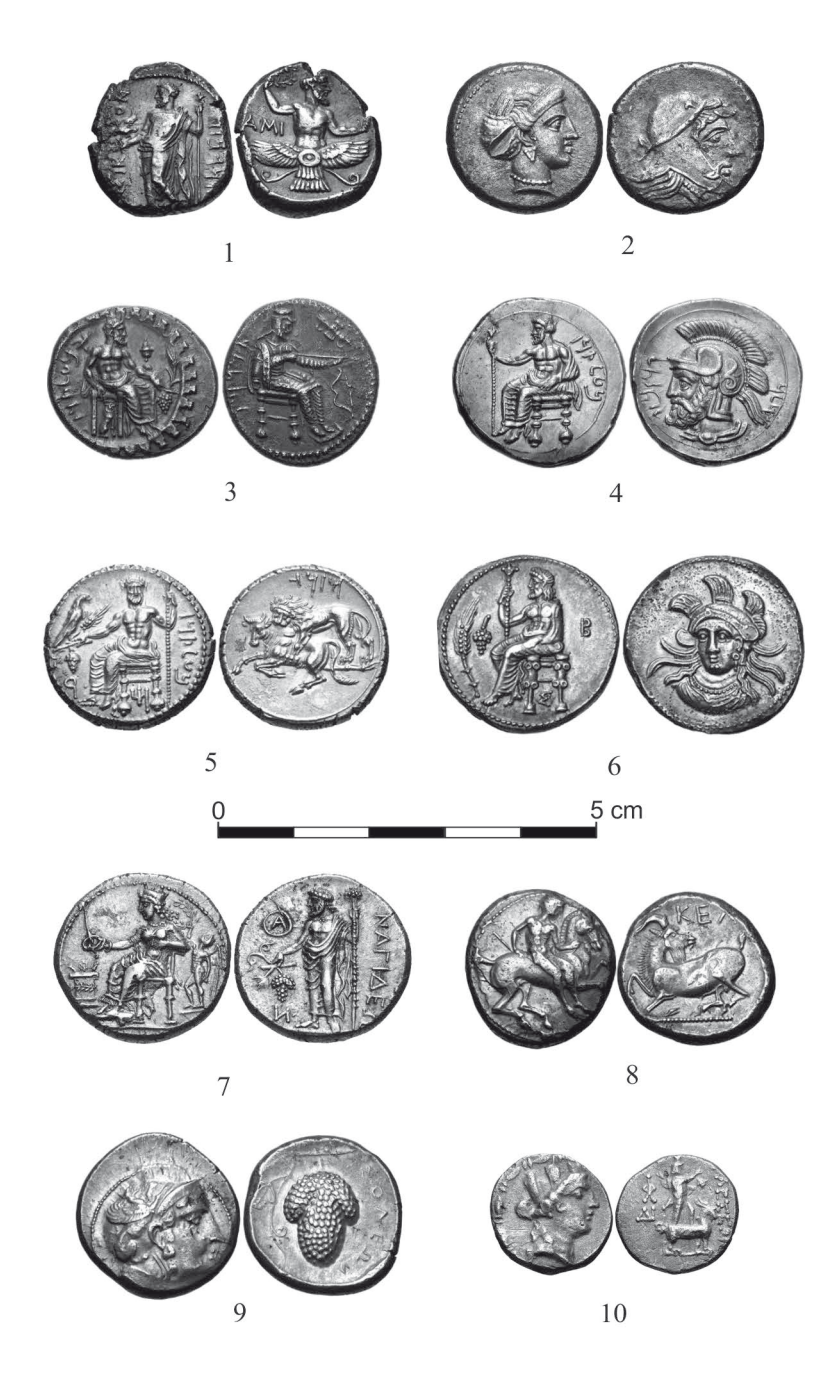
PLATE 2 E. Dąbrowa