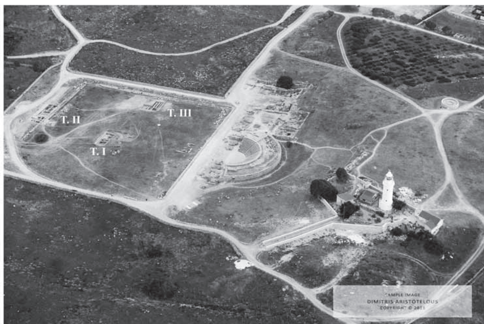
Pl. 1. 1 – A topographic map of ancient Nea Paphos. Drawing by U. Bąk (based on Medeksza 1992, il. 1)