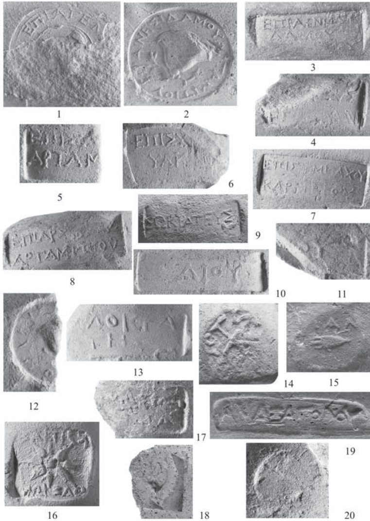
Pl. 2. Amphora stamps