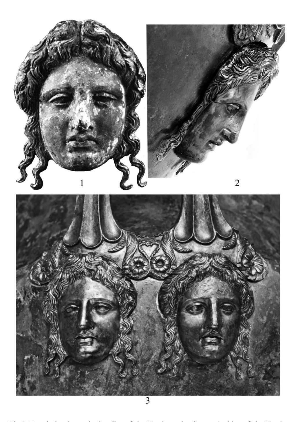
Pl. 4. Female heads on the handles of the Vergina calyx-krater.