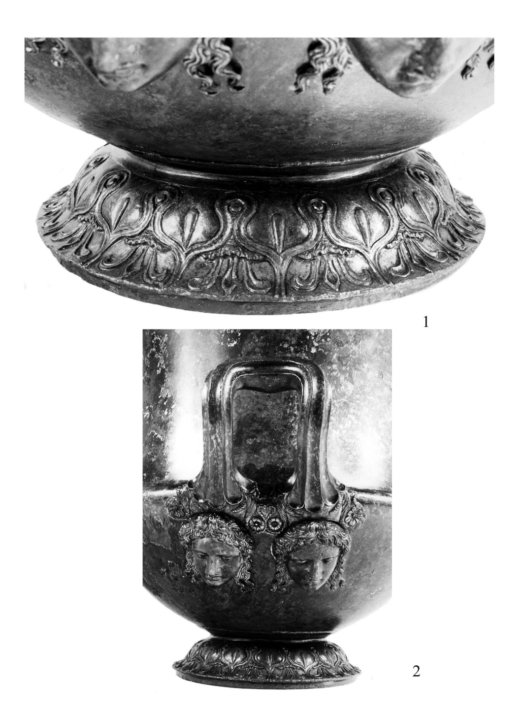
Pl. 3. The lower section of the Vergina calyx-krater – details. Archive of the Vergina excavation 1 – Vergina calyx-krater base; 2 – Vergina calyx-krater handle