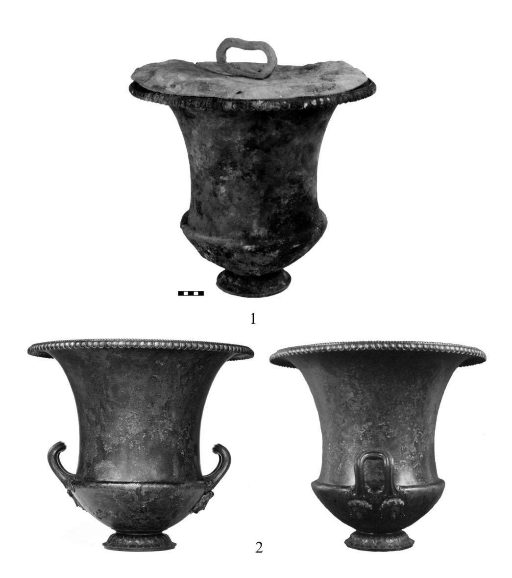
Pl. 1. The bronze calyx-krater from the 'Heuzey B' tomb at Vergina, Aigai. 1 – View with a lead disc cover; 2 – View of the calyx-krater sites