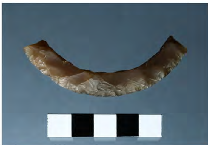
Pl. 3 – Fragment of the second Early Dynastic flint bangle from the settlement in Tell el-Murra. Drawing by the author.