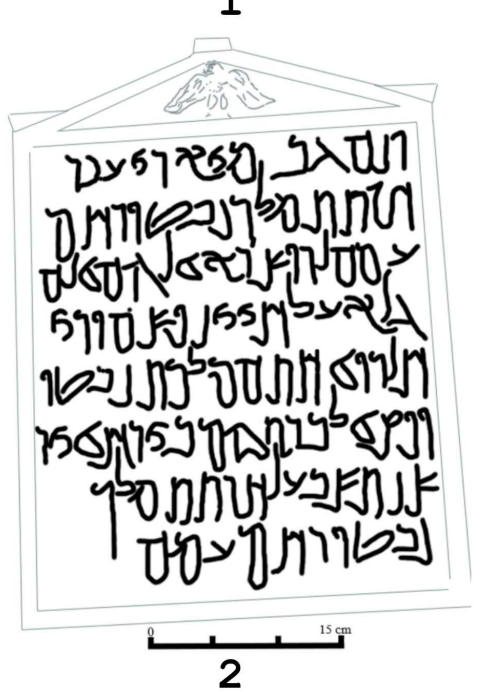
Pl. 1: 1 – Photograph of the inscription (Barkay 2019, 50, Figure 8.10) Pl. 1: 2 – Tracing of the inscription (drawn by the Z. al-Salameen)