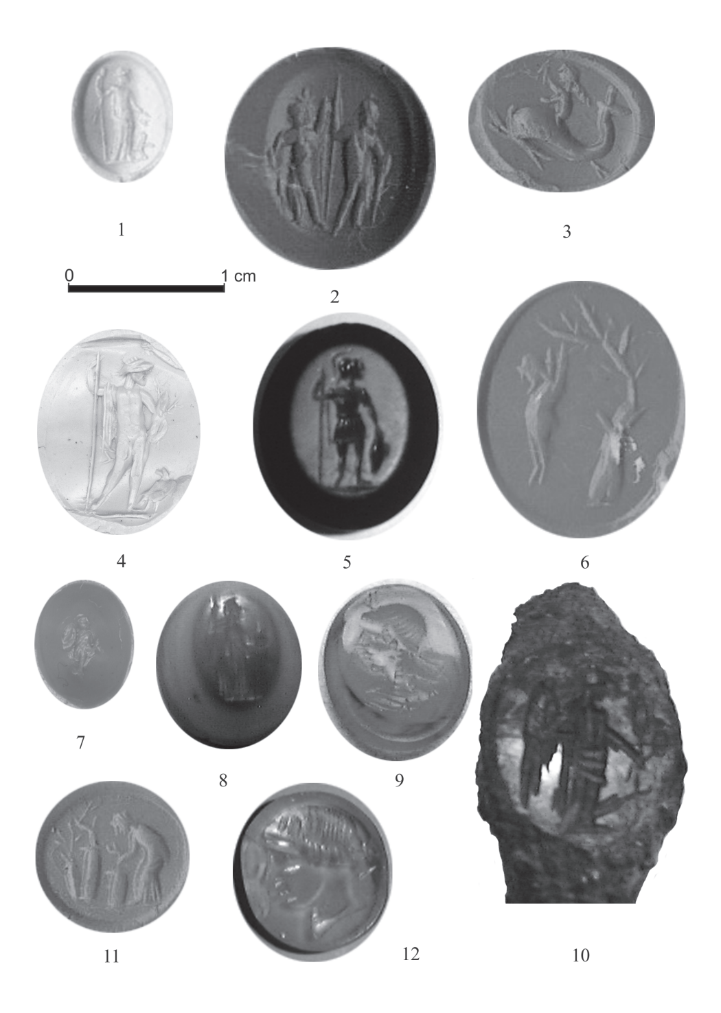
PLATE 1 G. Cravinho